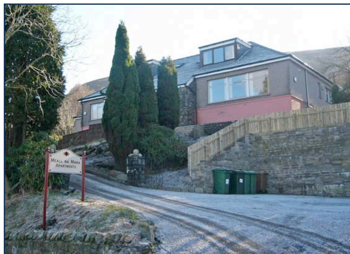
Meall na Mara: 'hill (lump or knoll) of the sea' .

All the people in Meall na Mara flats have their names on the Highland Council list, so that when they are ready they can move on to their own tenancy, and that may be with our continuing support.